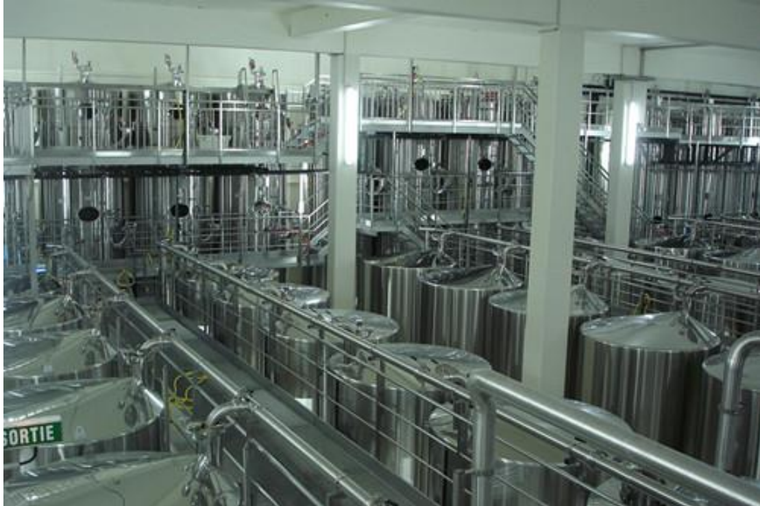
Lab Scale Fermentor Double Vessel: SDL-1/3/5/7/10L and food fermentation equipment